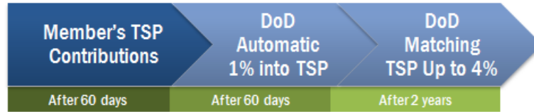
Chart 2-1: New Accession Eligibility for Automatic and Matching Contribution

NOTE: Current service members opting into the new Blended Retirement System between January 1, 2018 and December 31, 2018, will receive DoD automatic 1 percent contribution and up to 4 percent additional DoD matching beginning the first pay period after opting in – there is no 60 day/2-year waiting period as there is for new accessions starting January 1, 2018.